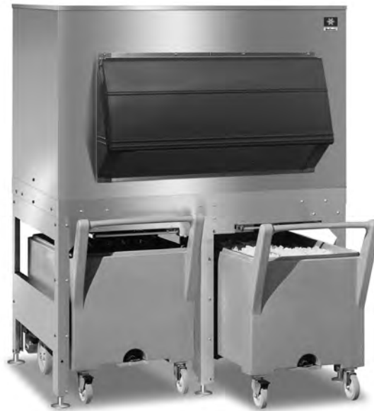
FC-1350 Ice Storage Bin & Cart System