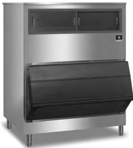
F-1300 Ice Storage Bin